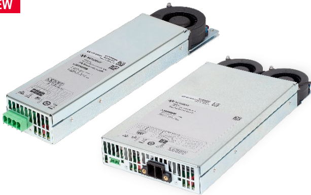
Figure 6a. The Electronic Load Series